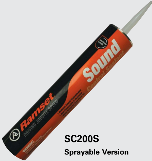
SC200S Sprayable Version