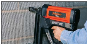
Lath attachment—using one-inch TrakFast discs and magnetic probe adapter