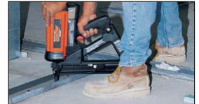
Track to concrete