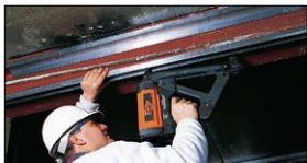
Track to steel