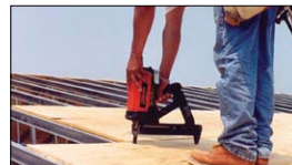
Plywood attachment—using TrakFast plywood to steel pin