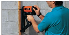
Furring attachment—perfect fastening every time in soft and hard base materials